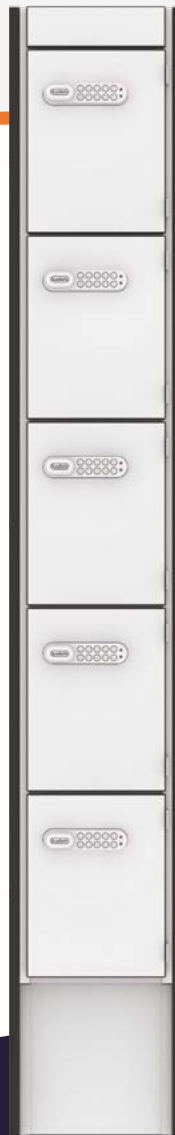
250mm Ideal for phones 105kg

FLEX™ Locker towers are 1858mm tall and 475mm deep