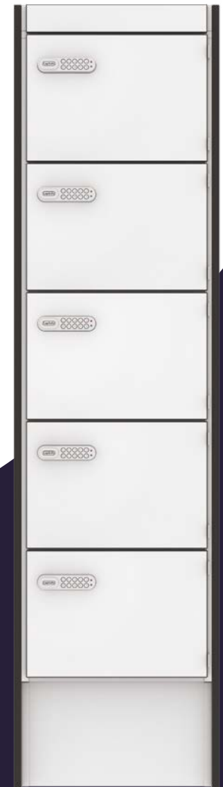
450mm Ideal for laptops & bags 135kg