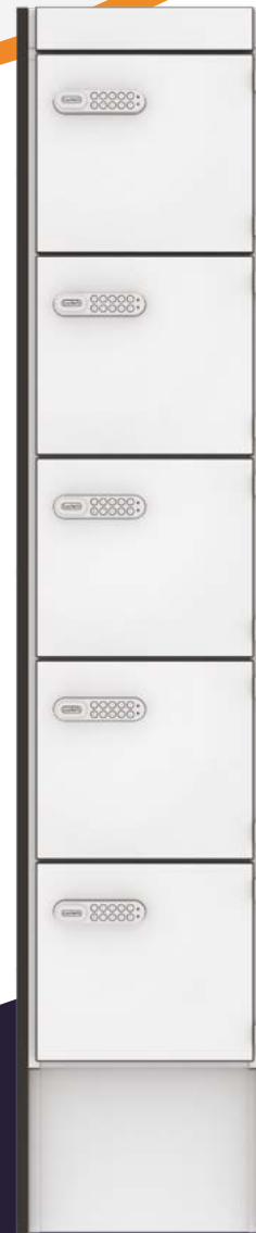
350mm Ideal for Chromebooks & tablets 120kg